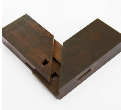
Mortise and Tenon