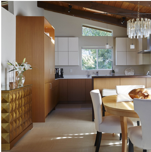
Natural - Lacquer