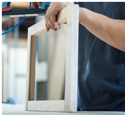
Butt-joint glued and stapled

Butt-joints are formed by two pieces of wood united end to end without overlapping. They are typically glued or stapled together. The technique of assembling the drawer involves manufacturing a box where the sides overlap the front. Glue or stapling is used to hold the piece together. The drawer front is then glued to the drawer box.